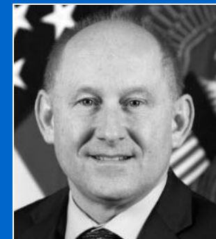
JOHN E. WHITLEY Former Acting Secretary of the United States Army