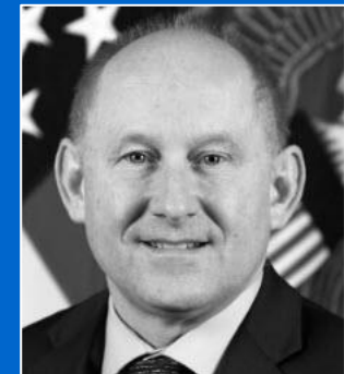
JOHN E. WHITLEY Former Acting Secretary of the United States Army