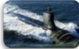
Land & Maritime