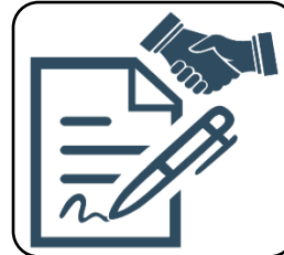
Acquisition & Contract

Technology Infrastructure and Architecture