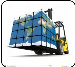
Logistics & Supply Chain